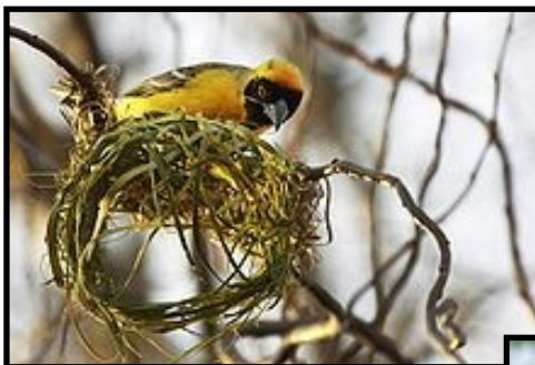
Male constructing his nest from grass and reeds