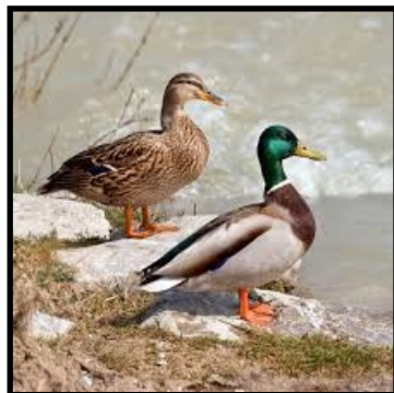
Left : Beautifully deadly - The Mallard Duck