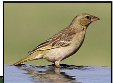
Female showing the buff underparts

Please feel free to submit any suggestions, comments or articles to editixcn@gmail.com