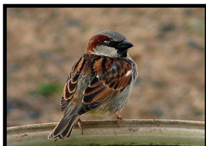
Above Top : Female House Sparrow