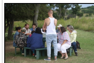
Round Table Discussions

Thank you all for your time and interest.